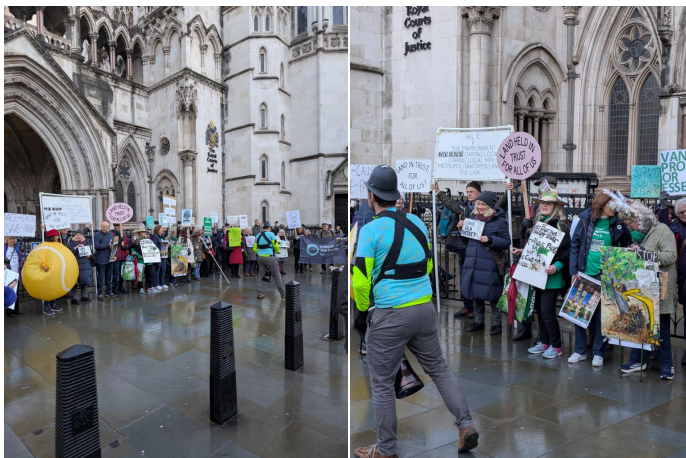
The stalwarts gather in front of the High Court — Jan 16th 2026